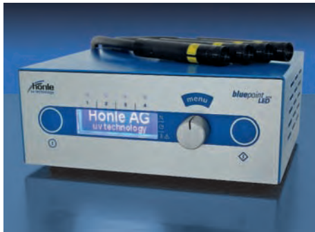
bluepoint LED eco

The point source bluepoint LED eco has been developed for all applications requiring a most intensive UV irradiation. Thanks to its high intensity and the capability to program complete process