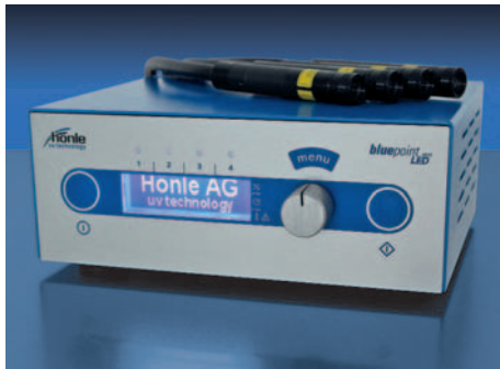
bluepoint LED eco

The point source bluepoint LED eco has been developed for all applications requiring a most intensive UV irradiation. Thanks to its high intensity and the capability to program complete process