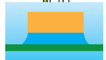
Variations in mounting height of adjacent components (up to 300 percent!)